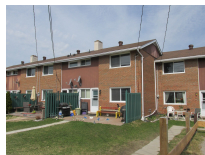
Back of Unit