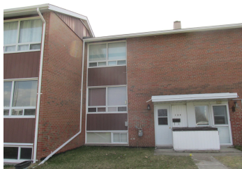
Front of Unit